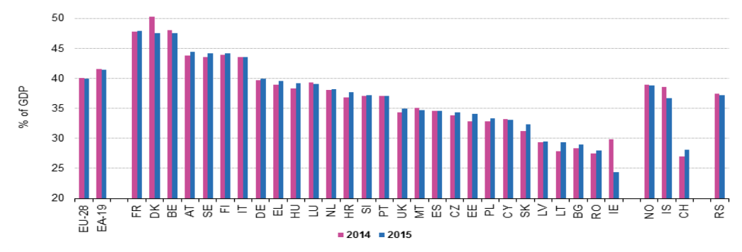
Figure no. 2. The share of fiscal revenues in GDP, E.U. countries, 2015

The level of tax revenue relative to GDP (taxes and social contributions) in Romania was 27.5% in 2015, also 12pp lower than the EU27 average (39.5%). The share of tax revenue in GDP is significantly lower than in similar economies such as Hungary (38.6%), Slovenia (37.6%), Czech Republic (34.3%) and Poland (32.8%). In order to better exemplify these, in Figure no. 2 we can see the share of tax revenues in GDP, at the level of EU countries, in 2015: